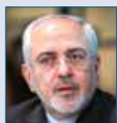
■ Dr Mohammad Javad Zarif ( jzarif@ut.ac.ir )

Key Interests: International Relations and Politics